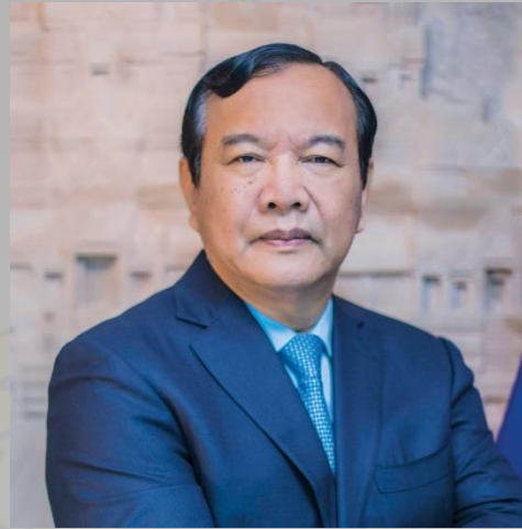
Senior Minister PRAK SOKHONN Deputy Prime Minister, Minister of Foreign Affairs and International Cooperation, Chairman of NCC for PKO