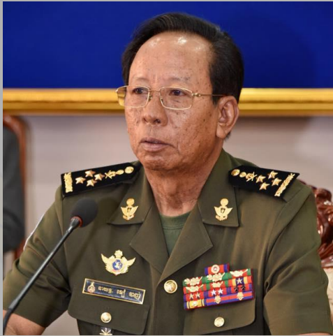
General TEA BANH Deputy Prime Minister Minister of National Defense